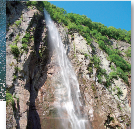
Yonako Great Falls