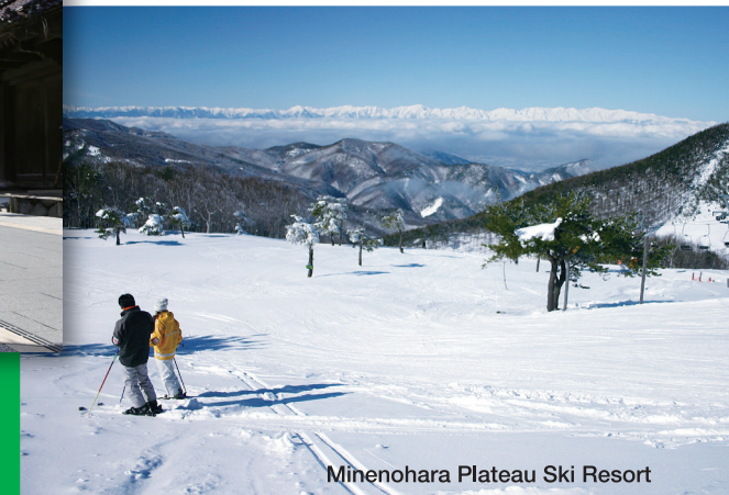
Minenohara Plateau Ski Resort