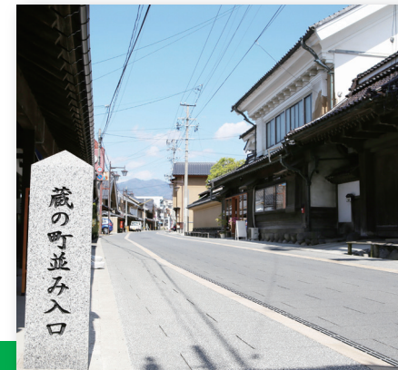
Townscape of Kura Warehouses